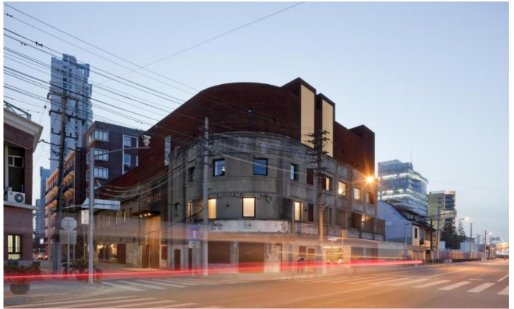
The Waterhouse at South Bund

world-architects.com Profiles of Selected Architects