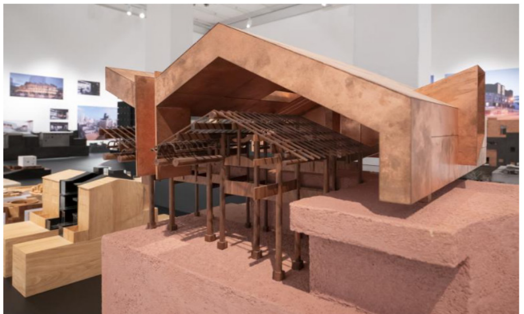
Exhibition view showing Fuzhou Teahouse

The exhibition at Aedes features 30 projects the office has designed since its founding in Shanghai in 2004. Documented in models, photographs, and videos, the projects reveal a delicate balance between the contrasts of new and old, smooth and textured, refined and raw, and between material contrasts and combinations of forms.