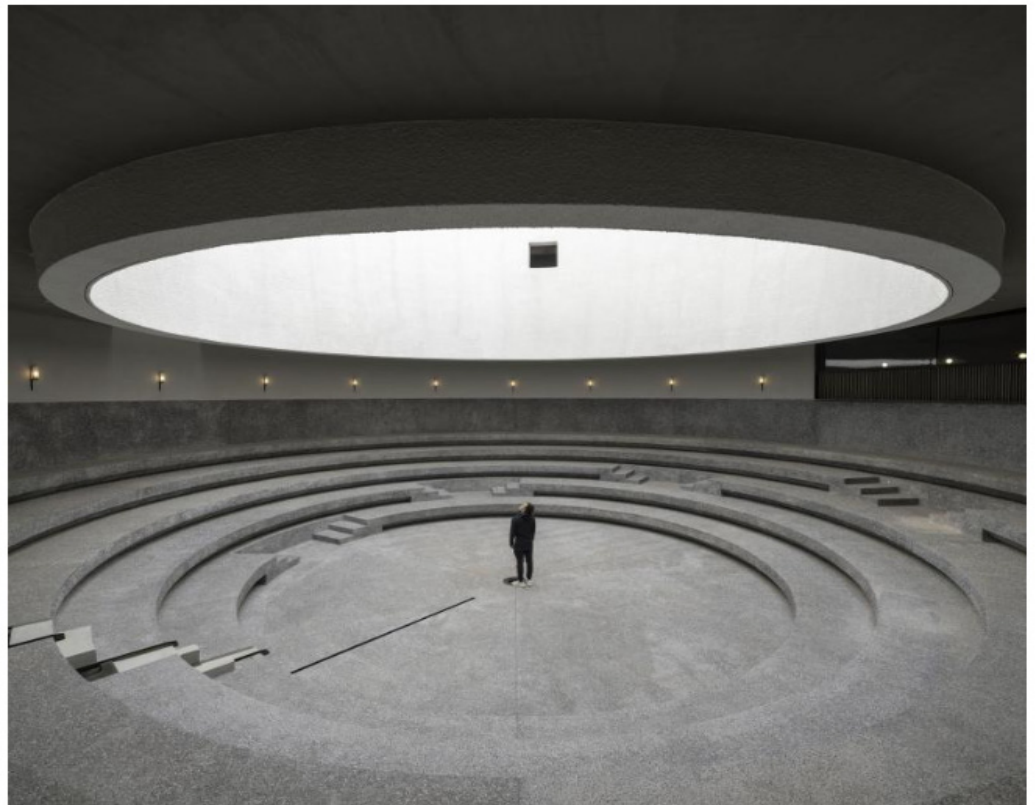
Aranya Art Center