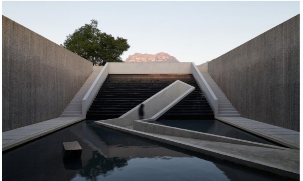
The Chuan Malt Whiskey Distillery

world-architects.com Profiles of Selected Architects