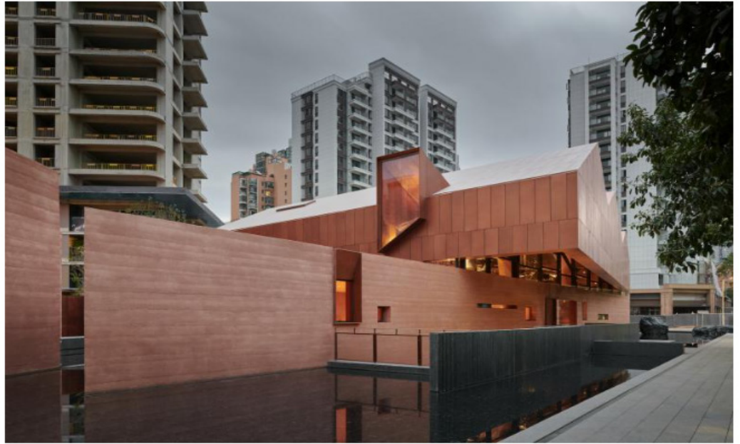
Fuzhou Teahouse

world-architects.com Profiles of Selected Architects