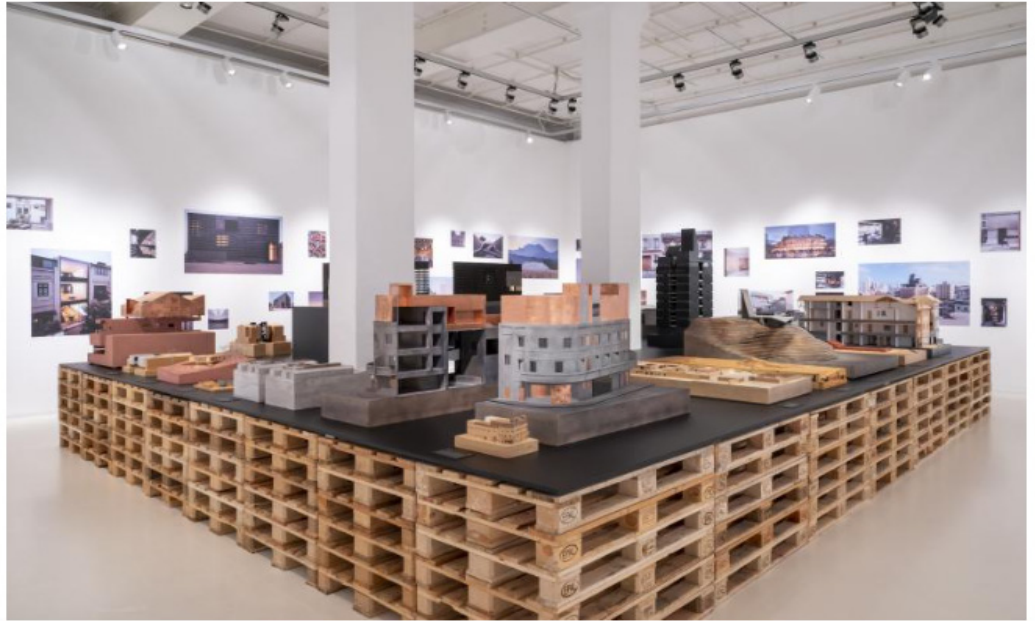
Exhibition view

world-architects.com Profiles of Selected Architects